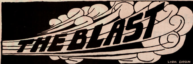
Original logo taken from Alexander Berkman's anarchist journal "The Blast" (1916-17).