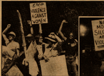
Women in Boston (left) and Denver (right) take back the night.

In Vancouver, on a rainy Friday night in August, over 300 women marched through the downtown streets chanting "Stop abuse of women! Women reclaim the night!" A leaflet drawing attention to the connections between all types of violence against women, in the homes as well as in the streets, was distributed. Faced with the fear and attempted harassment of some male onlookers, the marchers